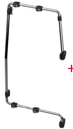
Kit Frame Crafter

04 Stainless steel rail support base For supporting up to 3 standard bikes or 2 E-Bikes