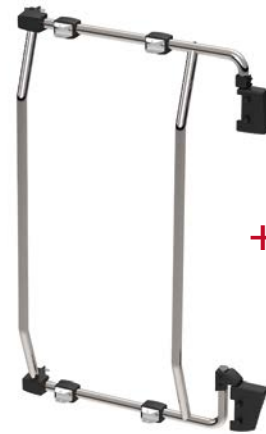
Kit Frame Ducato

04 Stainless steel rail support base For supporting up to 3 standard bikes or 2 E-Bikes