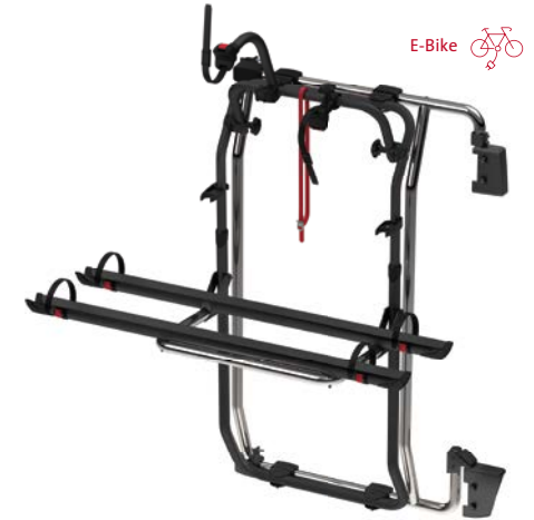
Carry-Bike Frame Ducato